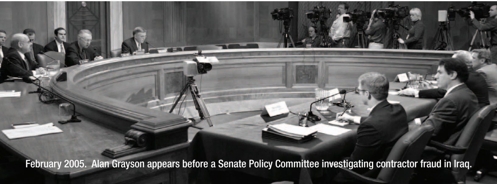
February 2005. Alan Grayson appears before a Senate Policy Committee investigating contractor fraud in Iraq.